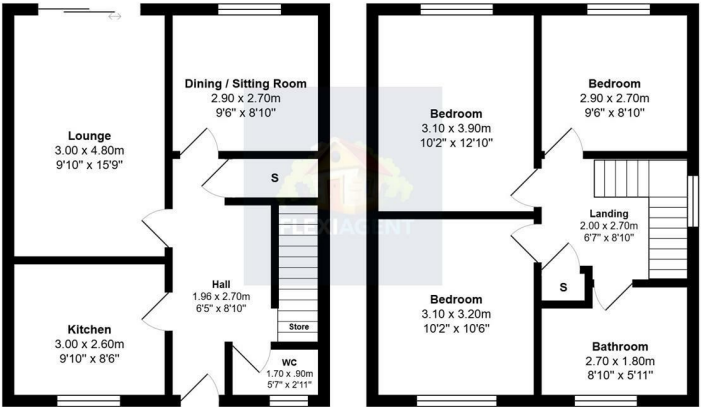
Total Area: 84.5 m 2 ... 909 ft 2 All measurements are approximate and for display purposes only